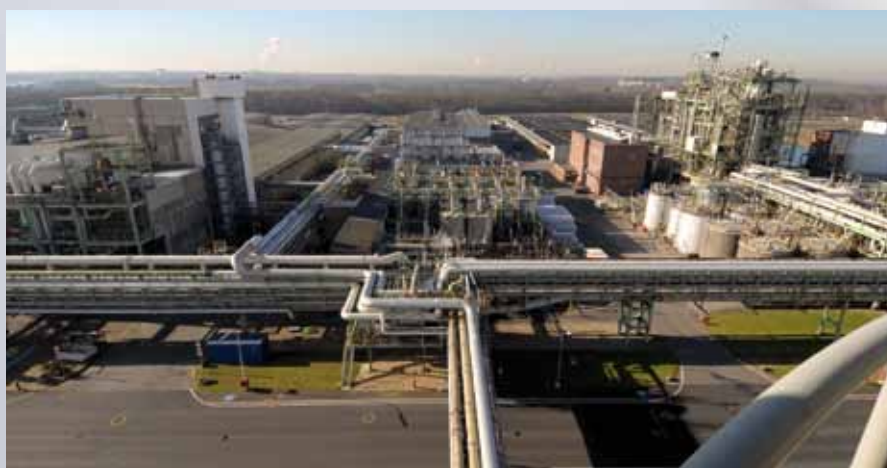
Baypren production plant in Dormagen/Germany.

The mechanical seals used in this application achieve excellent life times and have been running to the full satisfaction of the customer Lanxess. Mainly the flush at the product side has contributed to the significant increase in the seal's service life.